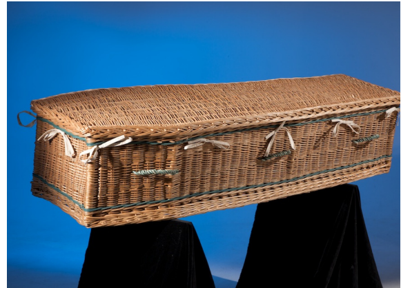
Wicker and Bamboo